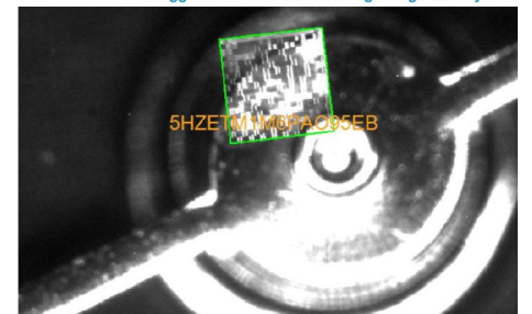
Microcode Datamatrix of 200µm in glass